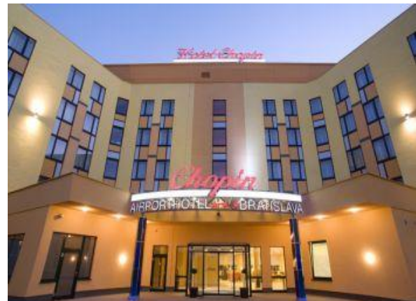
Hotel Chopin *** Location: Airport