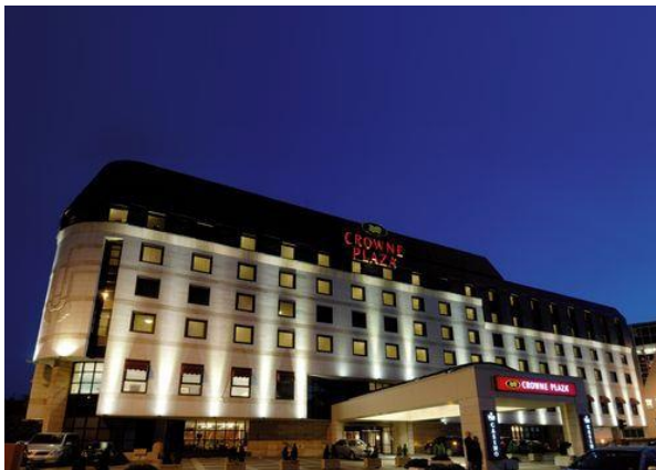
Crowne Plaza**** Location: Downtown