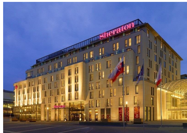
Sheraton***** Location: Downtown