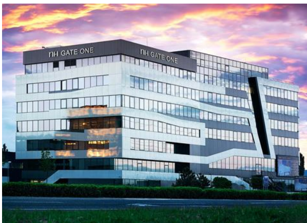
Gate One **** Location: Airport