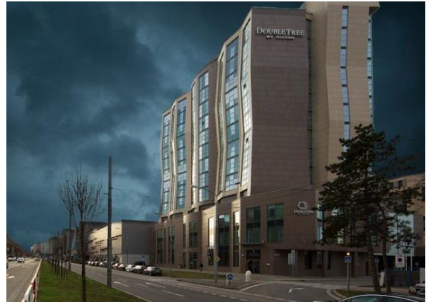
Double Tree**** Location: Airport/Downtown