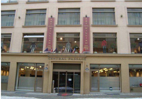
Art Hotel William**** Location: Downtown